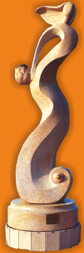
Statue of the Hope