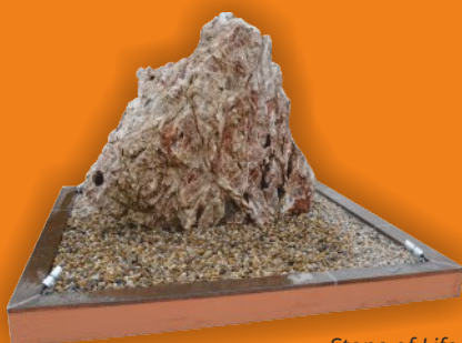
Stone of Life

Manager for Science and Physiotherapy Education; Manager for Stroke/TBI Rehab Services, Inpatient Coordinator, RC Kladruby